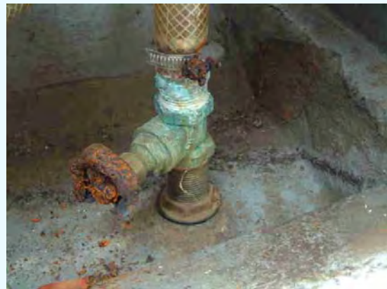
Corroded Gate valve