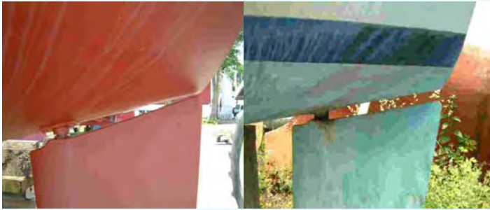
Two rudders, two Westerly Centaurs, the one on the left has a bent ruder stock