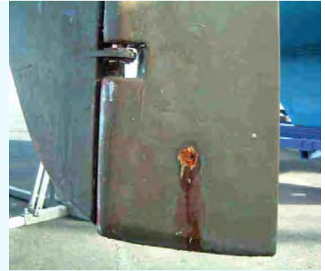
Might be worth investigating the cause of the rust staining