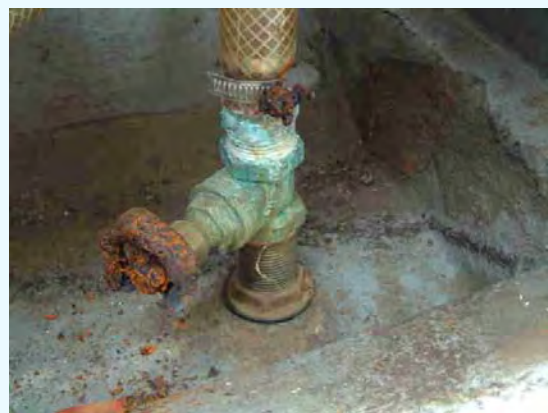
Corroded Gate valve