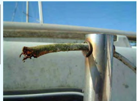
Corroded lifeline..not a lifeline you would trust your life to!