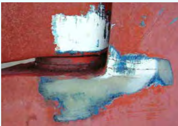
Cracking across the rudder neck close to the stock