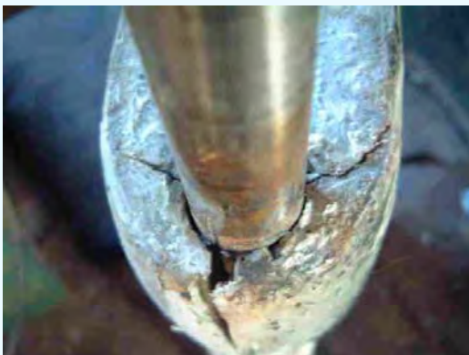
Serious cracking at rudder stock entry